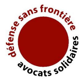
Défense Sans Frontière-Avocats Solidaires